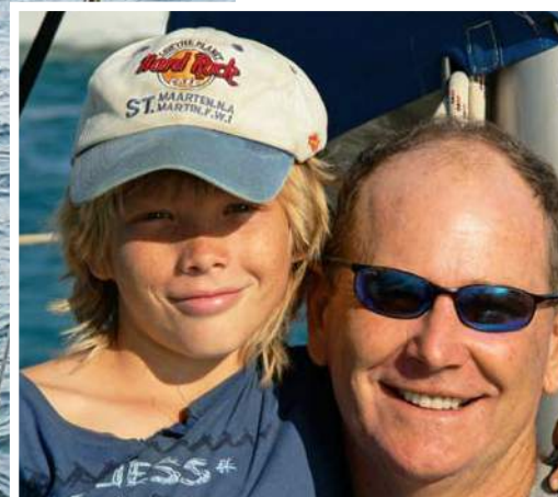
Ten years after